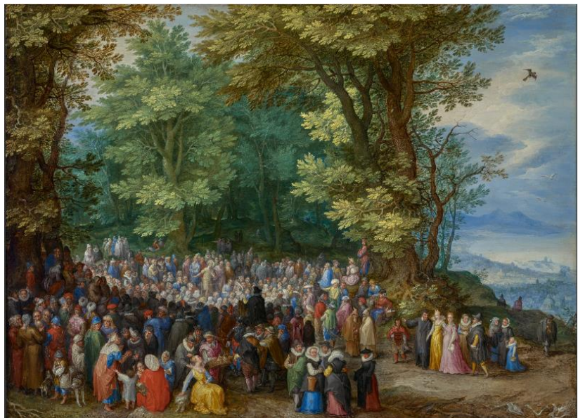
The Sermon on the Mount, Jan Brueghel the Elder, 1598

Father Hudson's Care is your local Catholic charity, supporting people in need across the Archdiocese of Birmingham. Father Hudson's staff and volunteers give their time and skills to help older people, disabled people, homeless people, refugees, people who are lonely, and children and young people who are experiencing difficulties. Father Hudson's Care is grateful to everyone who supports them, because it means they can reach out and help more people in need.