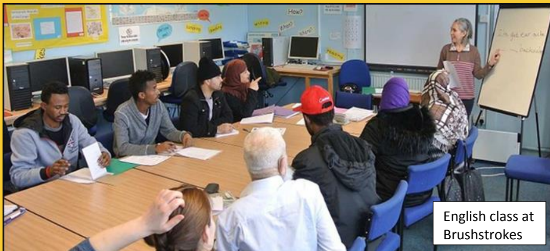
English class at Brushstrokes

In our Archdiocese, Father Hudson's Care has a project called Brushstrokes, which helps refugees. They give out food and clothing, they provide advice. And they help people learn English. Learning English means they can go to the doctors and tell the doctor what's wrong with them. It means they can ask for help. It helps them find work. And it helps them become part of the community and make friends, rather than feeling alone.